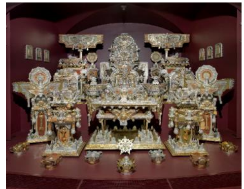
Image of The Throne of the Third Heaven of the Nations' Millennium General Assembly courtesy of the Smithsonian American Art Museum.

From the Smithsonian American Art Museum, explore what little biographical information is known about Hampton, and view high-resolution images of The Throne of the Third Heaven of the Nations' Millennium General Assembly and accompanying crowns.