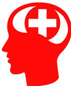
Ohio LSTA Funding Available to Public Libraries for Mental Health First Aid (MHFA)

The vision of the State Library of Ohio is a Smarter Ohio where every Ohioan can access the necessary resources to be engaged citizens, excel at their jobs, participate in the workforce, and pursue their passions and interests.